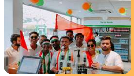
Celebrations at Wild Bean Cafes