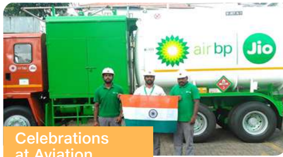
Celebrations at Aviation Fuel Stations